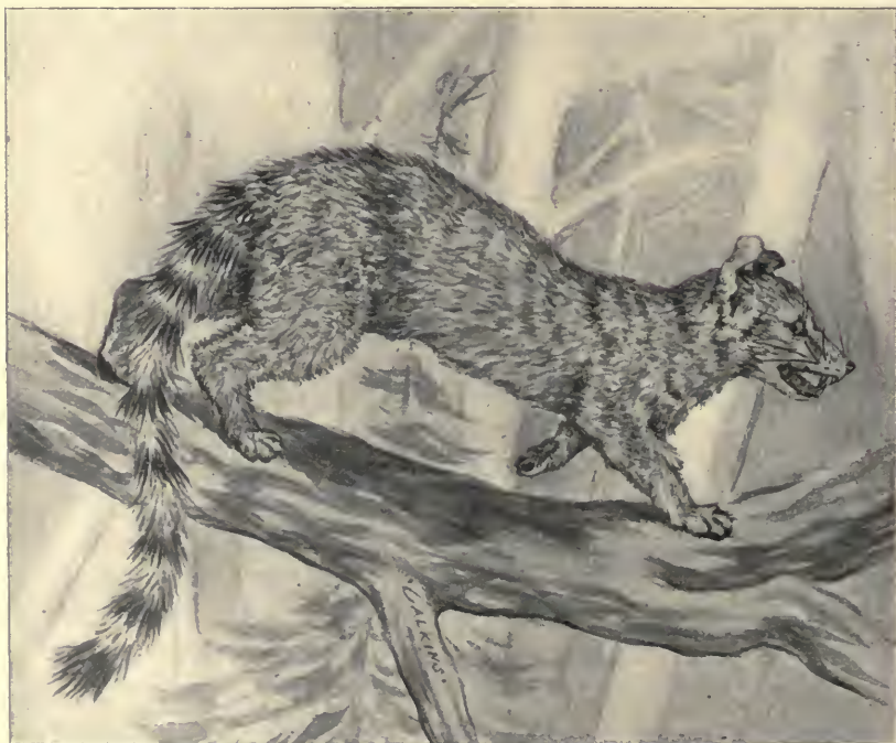
FIG. L. BASSARISCUS ASTUTUS. COMMON RACCOON-FOX.